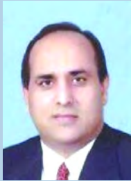
HAFIZ MOHAMMAD YOUSAF