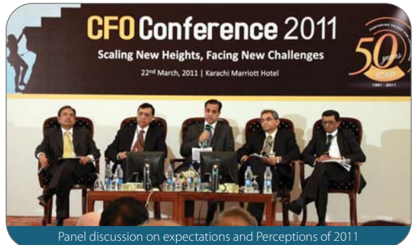
Panel discussion on expectations and Perceptions of 2011