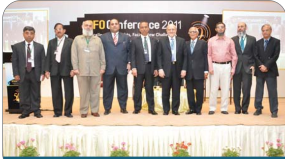
A Group Photograph at the CFO Conference