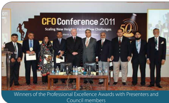
Winners of the Professional Excellence Awards with Presenters and Council members