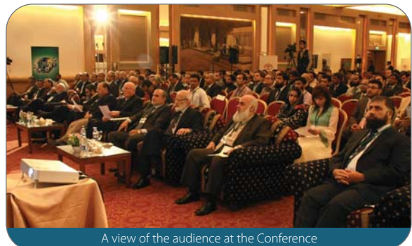
A view of the audience at the Conference