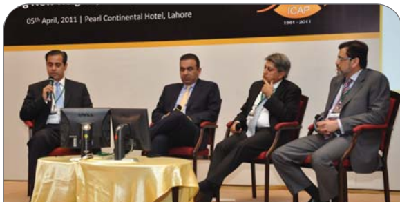
Panel discussion on "Conversation with Industry Leaders- Expectations & Perceptions of 2011 Outlook"