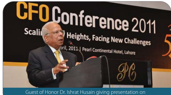
Guest of Honor Dr. Ishrat Husain giving presentation on "Pakistan macro - economic picture & the prospects ahead"