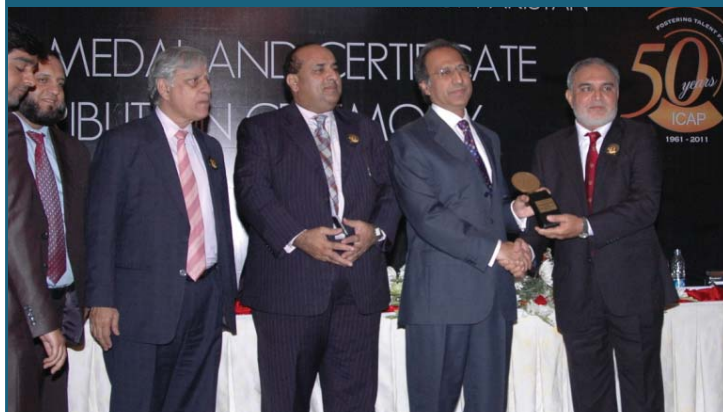
The President ICAP along with the Council Members Felicitating the Chief Guest Dr. Abdul Hafeez Sheikh, Finance Minister