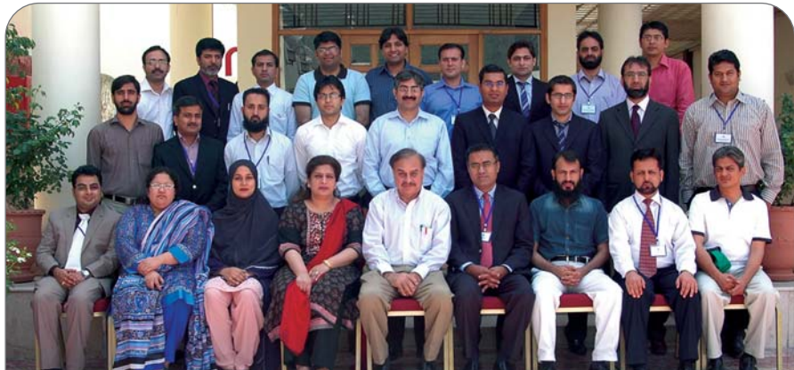
A group picture of participants of Business Communication program held in Islamabad