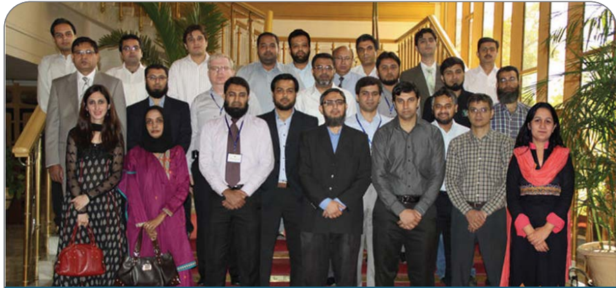
A group picture of participants of Financial Derivatives program held in Karachi