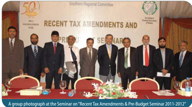
A group photograph at the Seminar on "Recent Tax Amendments & Pre-Budget Seminar 2011-2012"