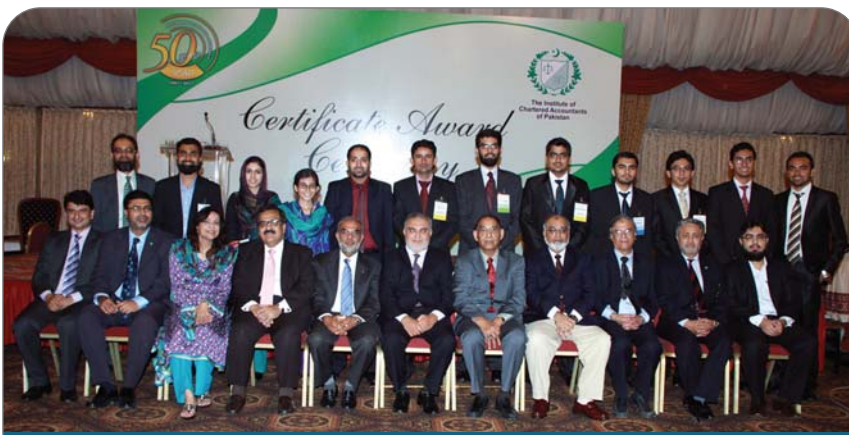
A group photograph on the occasion of CA Award Ceremony held in Karachi

Some of the newly qualified CAs, and their parents were also invited to express their feelings on this occasion. Examination Certificates, Gold Medal were distributed by the Guest Speakers, President, Vice President-South and other Council members of ICAP.