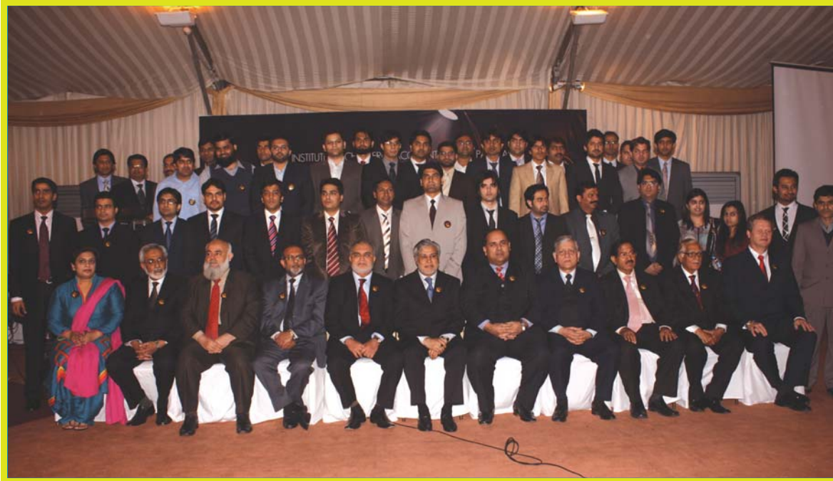
Qualifying Chartered Accountants with the Chief Guest, President and the Council Members