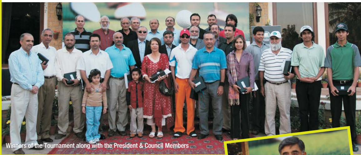
Winners of the Tournament along with the President & Council Members

Prize Distribution Ceremony - February 20, 2011