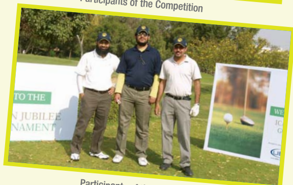
Participants of the Competition