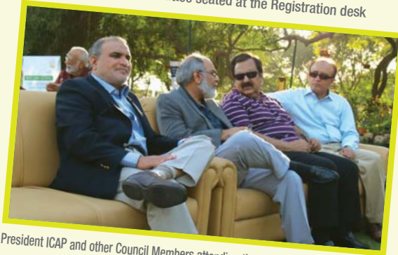
President ICAP and other Council Members attending the Prize Distribution Ceremony