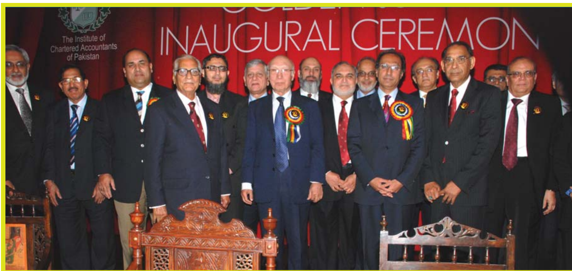
The Chief Guest, Key Note Speakers with the President and the Past Presidents

with the nature of the expectations changing, by keeping tab on the environment and being responsive to the stakeholders concerns. He stressed that irrespective of operating in the private or public sector an accountant needs to be vigilant and innovative which affects the credibility of the profession. As auditors of the public sector the AGPR strives to provide to the demands of the stakeholders, and has adopted the code of ethics, however he expressed the interest that AGPR wanted to work and increase the collaboration with ICAP for developing the public sector.