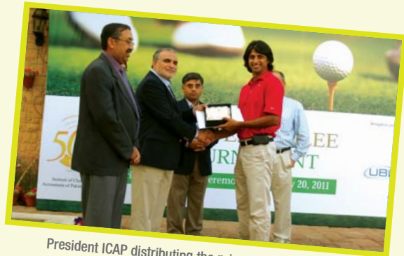
President ICAP distributing the prizes at the Ceremony