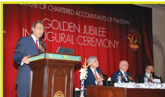
The Chief Guest Dr. Abdul Hafeez Sheikh addressing the gathering

Fifty years ago on the 3rd of March, the Chartered Accountants Ordinance 1961 received assent of the President of Pakistan which set the foundation of our Institute. Keeping in mind the historic affiliation, Friday 4th of March 2011 was chosen to inaugurate the celebrations of the Golden Jubilee Year at Serena Hotel Islamabad. The ceremony Honorable Minister of Finance, Dr. Abdul Hafeez Sheikh graced the occasion as the Chief Guest, with Vice Chancellor Beacon House National University Mr. Sartaj Aziz and the Auditor