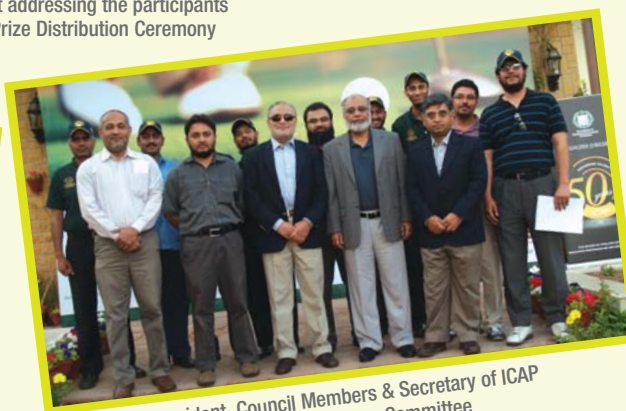
President, Council Members & Secretary of ICAP with the Organizing Committee