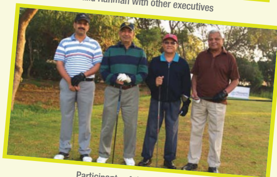
Participants of the Competition