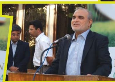
President addressing the participants at the Prize Distribution Ceremony