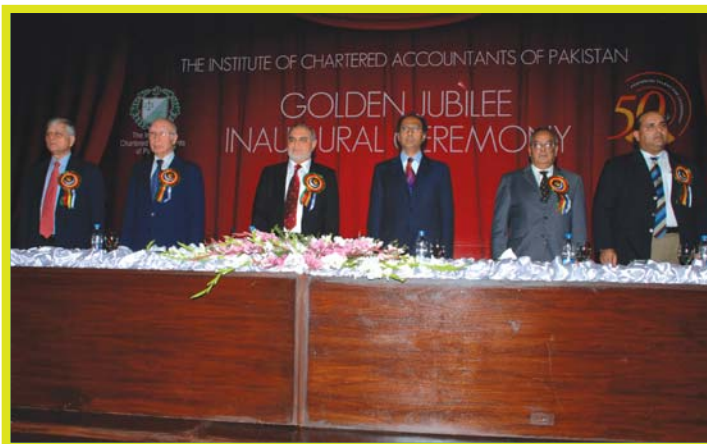
Paying respect to the National Anthem