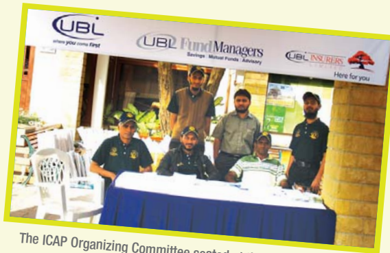
The ICAP Organizing Committee seated at the Registration desk