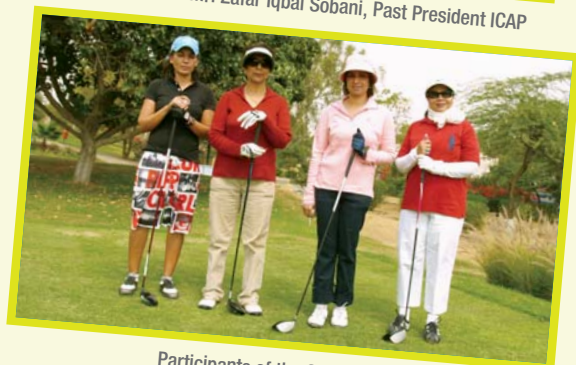
Participants of the Competition