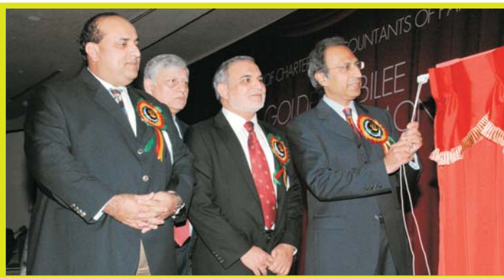
The Chief Guest Dr. Abdul Hafeez Sheikh unveiling the Golden Jubilee Mascot

The Chief Guest of the evening Dr. Abdul Hafeez Sheikh unveiled the Golden Jubilee mascot- a life memento incorporating the Logo of ICAP and the Golden Jubilee Logo. The Chief Guest in his address appreciated the opportunity given to him to address the gathering of eminent professionals. He said he came here looking for inspiration to believe and to be the best from the members of the Institute. He appreciated the role of the members of ICAP for their adherence to integrity, commitment to their vision and projecting a positive image of ICAP at home and abroad. He expressed his pleasure at the steadfast role of ICAP as a consistent partner of the government, appreciating the professional advice and expertise in implementation of standards and formulating the budget policies and tax reforms. The current situation is tough for the government and only with cooperation of the masses and institutions like ICAP can it be improved. He highlighted the role of the accountants in the public sector saying that the playing field is set with the right amount of hunger for transparency and the intake of the Chartered Accountants will increase the confidence of not only the public but also at the international front. He ended by asking all present to individually start being accountable to their country, it is only when we stand together that we will be able to see through the challenges.