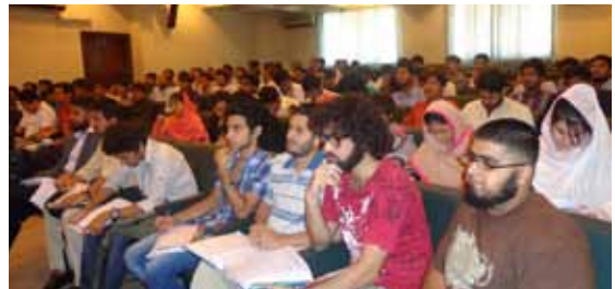
A view of students attending the session.

Following the popularity of earlier crash course sessions, a crash course session for this year was arranged. It was organized at ICAP Islamabad for various subjects of Foundation and Intermediate in August, 2012. The best teachers of the subjects from different institutions conducted the course. The course received tremendous response and with around about five hundred students attending it. The students gave positive feedback regarding the effectiveness of the classes.