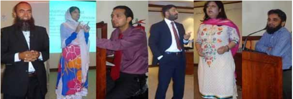
Teachers conducting sessions for various subjects.