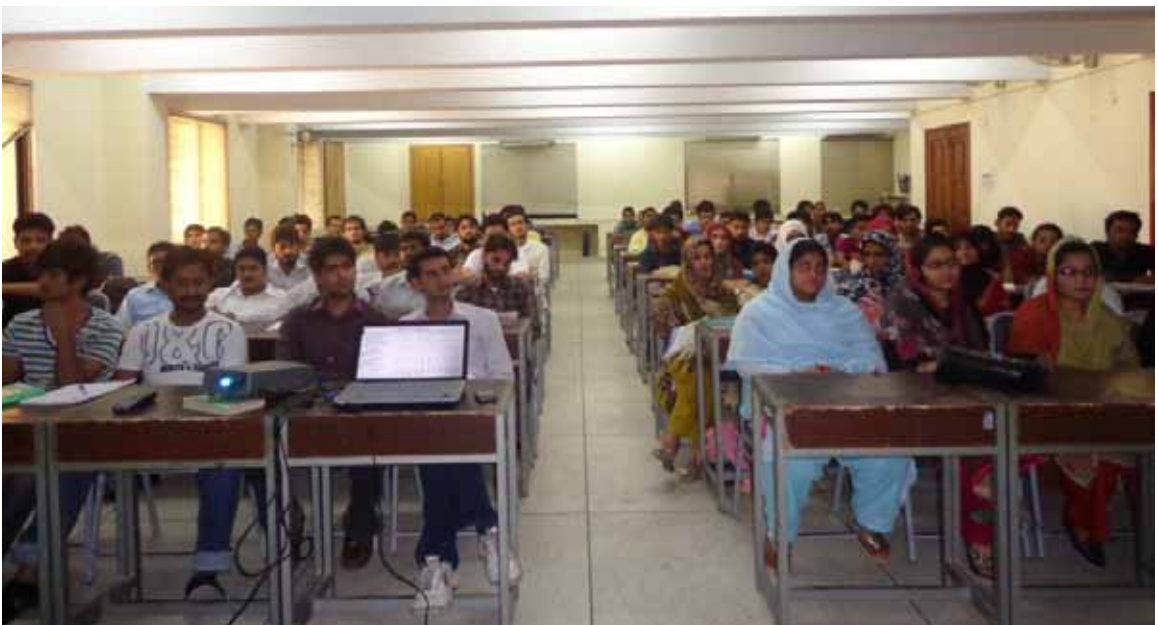
A view of students attending the Crash Course 2012