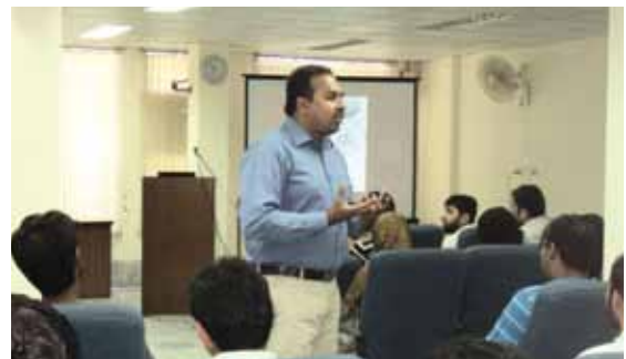
Teachers conducting sessions for various subjects.