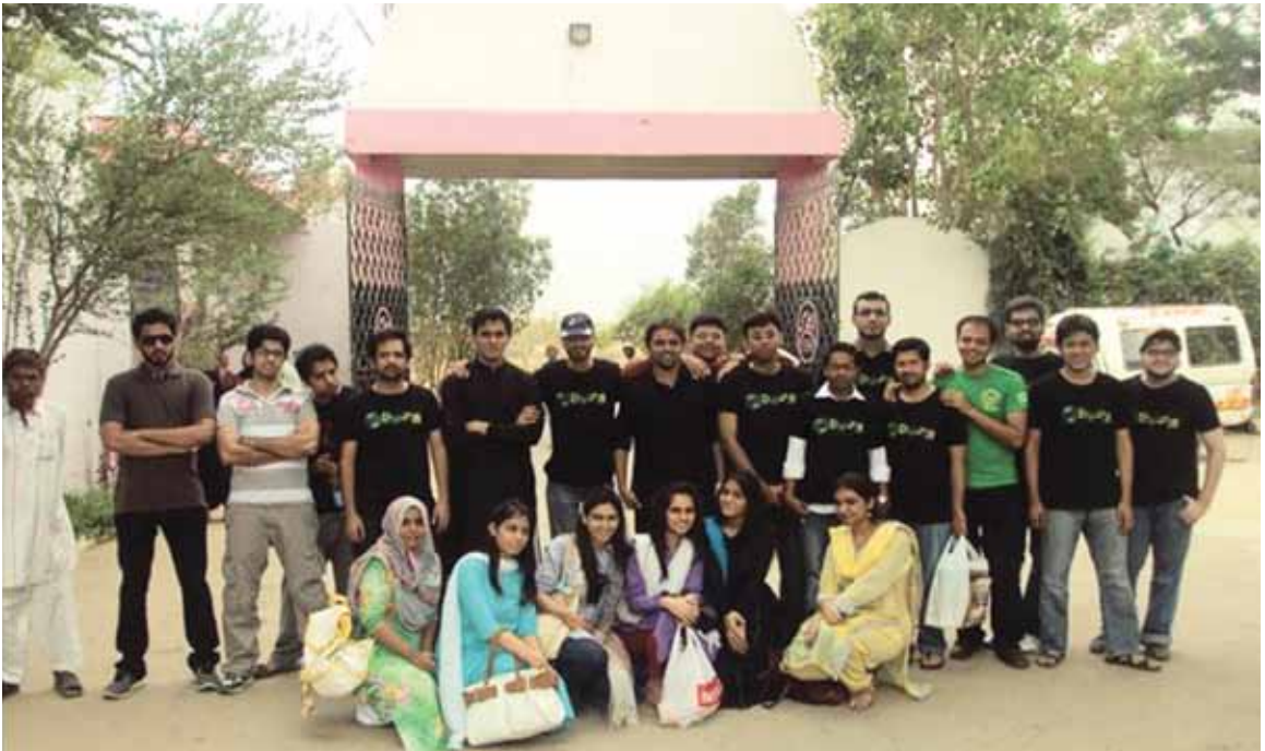
CASA – SOUTH Management team at The Edhi Village Nooriabad

the entralling grooves of the young children made the CASA team spell bound. Racing, rope hoping and face painting were some activities that brought smiles on the tender young faces. Team CASA then distributed the gift packs among the children.