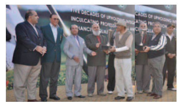
Chief Guest presenting trophies to winners of CA Catagory