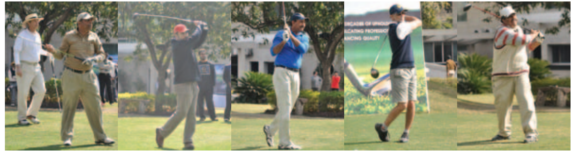
Golfers in Action