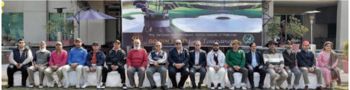
Group photo of golfers with President ICAP, Council Members and Chairman Golden Jubilee Committee