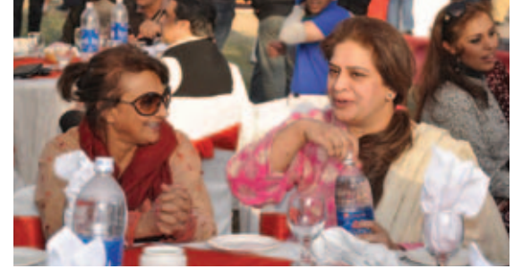
Audience at Golf Tournament Lahore