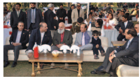
A group of members enjoying the golf