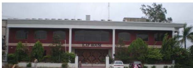
Old view of Regional Directorate - North, Lahore