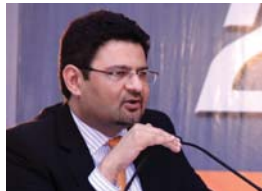
Dr. Miftah Ismail, Chief Guest

The Southern Regional Committee (SRC) of the Institute of Chartered Accountants of Pakistan (ICAP) organized the Post Budget Seminar on June 6, 2014 at the Taj Marquee (Adjacent to Mövenpick Hotel Karachi). The seminar was attended by around 1,100 participants comprising of both members (including past presidents) and non-members.