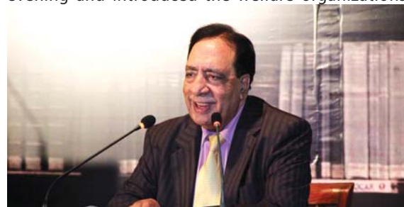
Mr. Ata-ul-Haq Qasmi commencing the evening with his choicest readings from his books