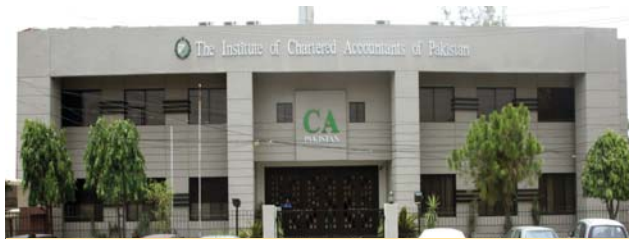
View of Newly Elevated Building of Regional Directorate - North

All assembled prayed for the growth and development of the profession and Institute. New façade of ICAP Lahore is a light grey building with metal strips used for enhancing the structure. This face lifting demonstrates our commitment to change with time and project a smart and soft image of the Institute.