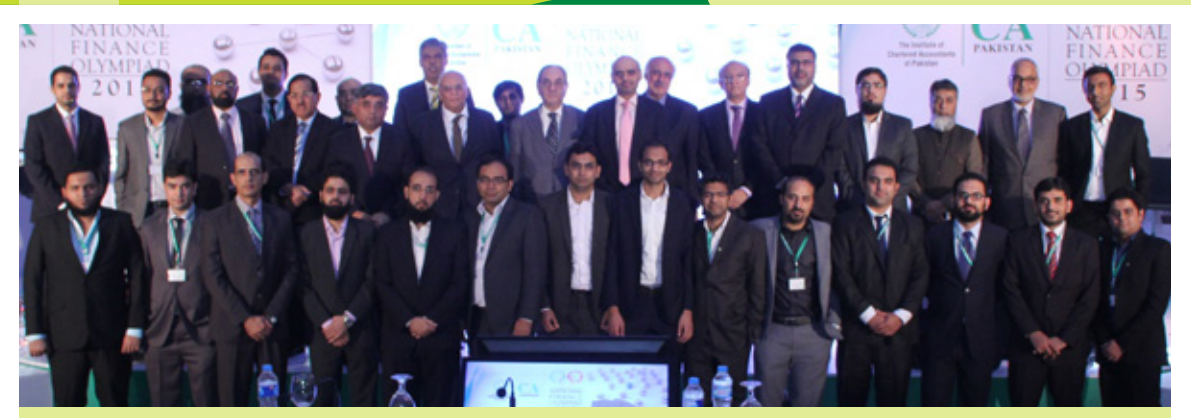
Group picture of NFO teams, judges, ICAP Council members, technical partners and Unilever representatives.

The Institute of Chartered Accountants of Pakistan