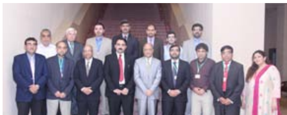
Group photo of the DTP participants.

The Institute of Chartered Accountants of Pakistan (ICAP) concluded the 14th Directors Training Program (DTP) session on May 14 and 15, 2015 at Serena hotel Islamabad. The Institute remains steadfast in its commitment to the corporate governance and the directors' training program is one such initiative. The program provides the directors' training to familiarise them with the code, applicable laws, their duties and responsibilities so as to enable them to