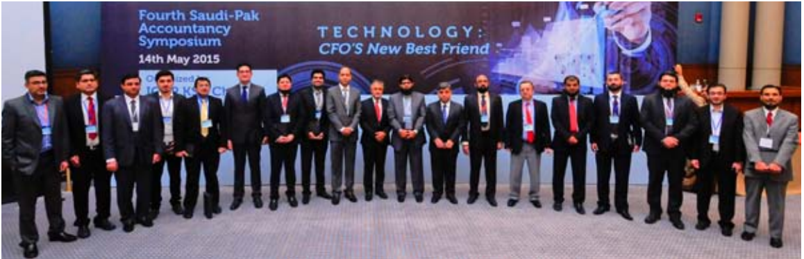
Group photo of organising committee with ICAP president and vice presidents.