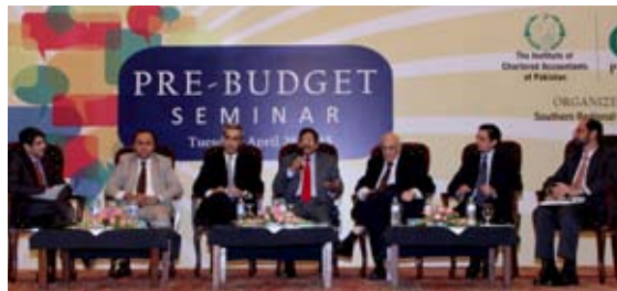
A view of the panel discussion session at the Pre-Budget Seminar.