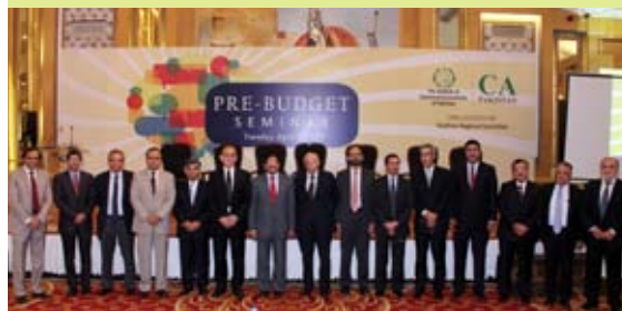
Group photo of the organising committee with Council members.

The Institute of Chartered Accountants of Pakistan (ICAP) Southern Regional Committee (SRC) organised the Pre-Budget Seminar 2015-16 on April 28, 2015 at the Karachi Marriott hotel.