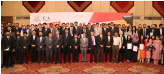
Group photo of the qualified CAs with Council members.

The Institute of Chartered Accountants of Pakistan (ICAP) Southern Regional Committee (SRC) organised a Certificate Distribution Ceremony for the newly qualified Chartered Accountants in Karachi at Pearl Continental hotel, Karachi on April 14, 2015. The theme of the event was Ready.Set.Go . 140 qualified CAs attended the ceremony with their families.