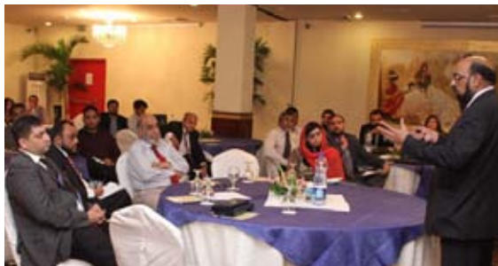
Session at Pearl Continental hotel, Karachi.