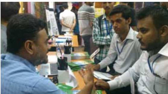
Students with ICAP team at Edwise Expo.

Guiding the underprivileged has always topped the priorities of CA Pakistan when it comes to career counsel the students; it is a responsibility that ICAP