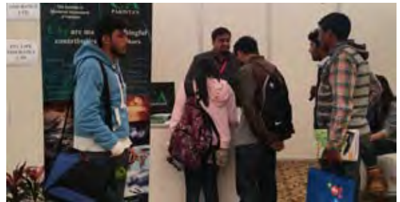
Forman Christian College job fair at Lahore.

ICAP Marketing and Communication (MARCOM) department participated in various career fairs/expos to educate the potential students regarding the CA qualification. The ICAP stall was visited by students accompanied by their parents who inquired about the program. They were briefed about the qualification of CA, entry requirements, future career prospects of pursuing CA. The parents took great interest in the information and asked a lot of questions to clarify their concerns.