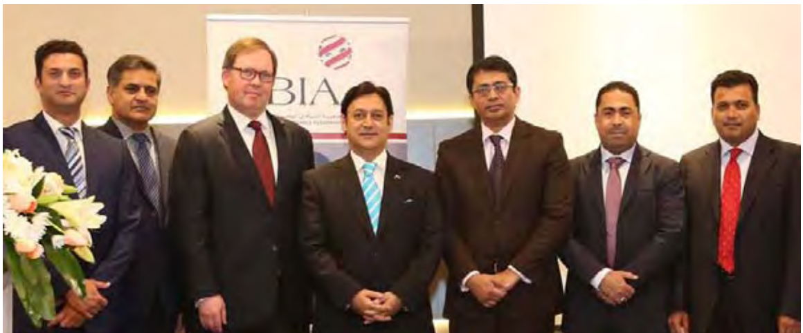
Managing committee and guests.