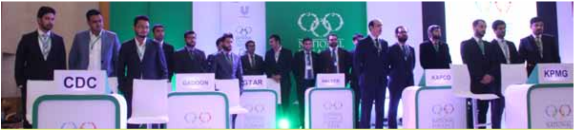
Anxious teams waiting for the results.