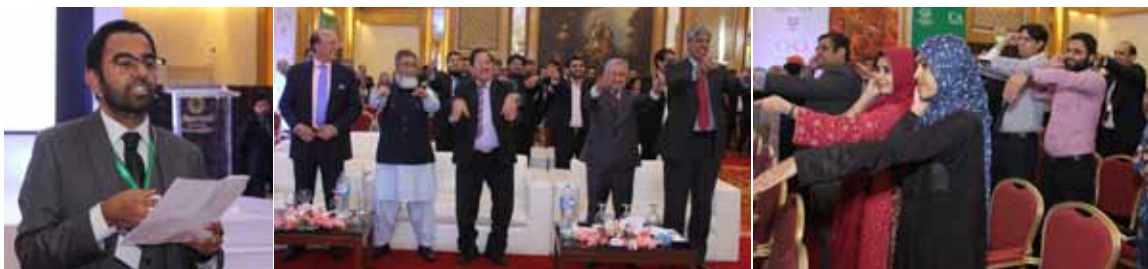
MOC Mansoor Soomro