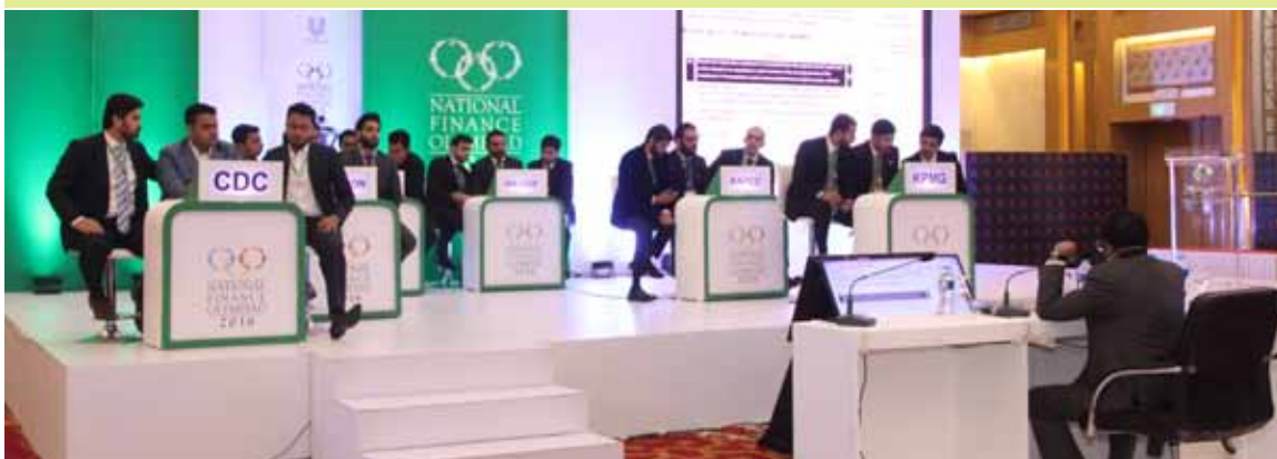
Direct Q&A Round - moment of happiness.