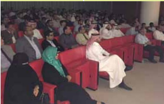
View of participants attending the CPD event.