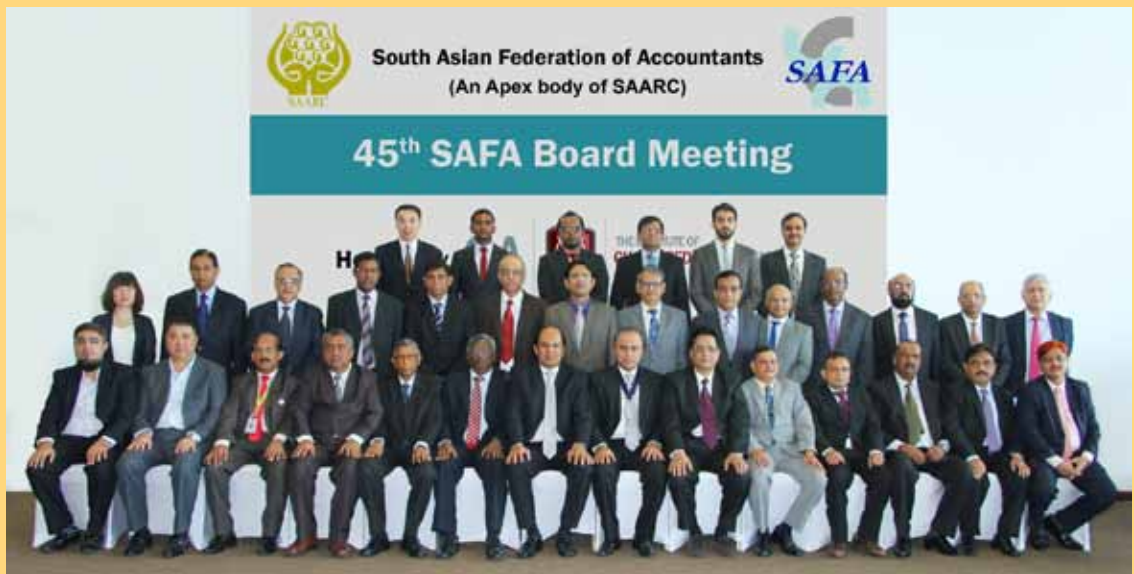
Group photo at 45th Board meeting of South Asian Federation of Accountants (SAFA) in Sri Lanka.