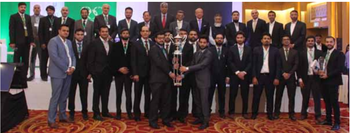
Group photo of the six finalist teams, ICAP Council members, past presidents and members of the NFO Organising Committee.

For more information about the event, please log on to www.icap.org.pk/nfo or visit the facebook page nfo@nationalfinanceolympiad .