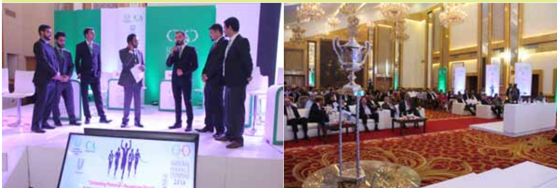
Suspense on stage as master of ceremony announces the National Finance Champion 2016.