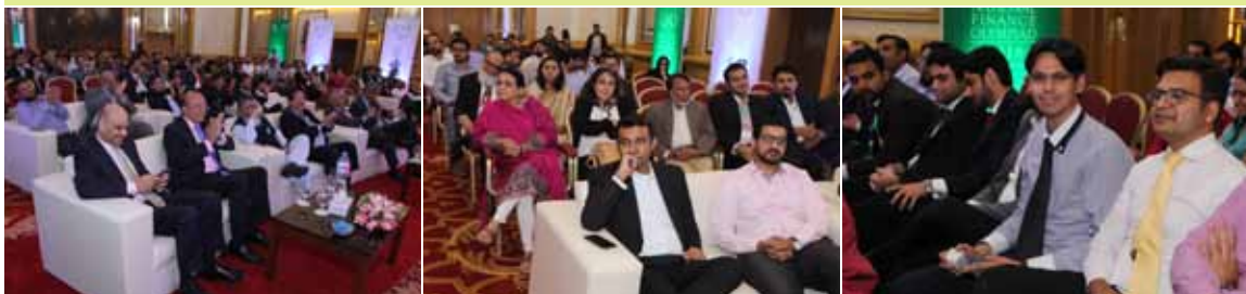
The audience at the event.