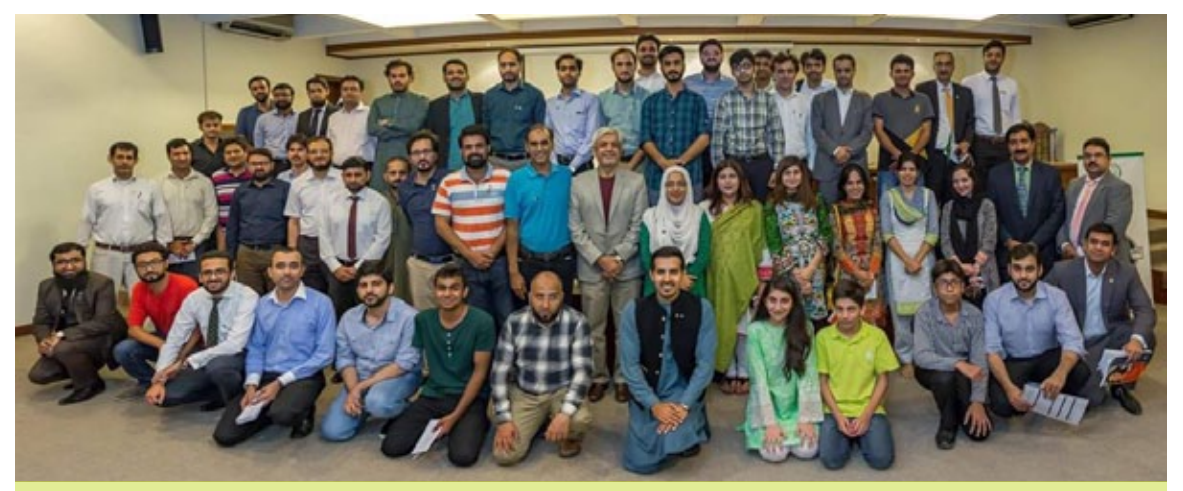
Participants of meeting number 25.