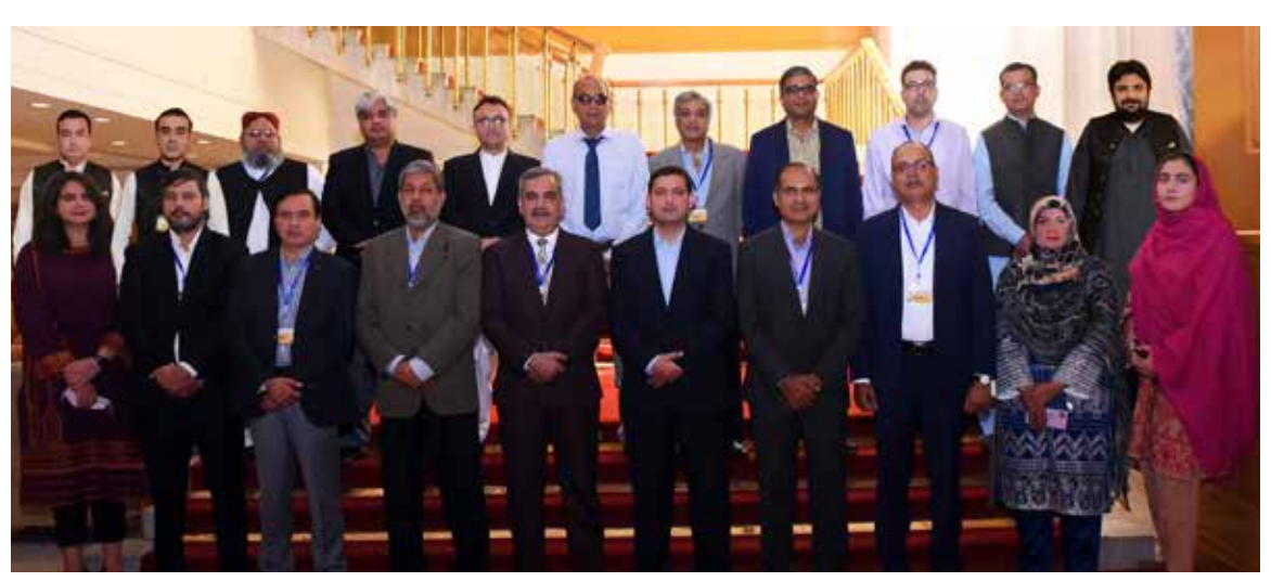
Participants and Trainer of 53rd ICAP Directors' Training Program at Marriott Hotel Karachi Session Two: November 3-4, 2020

The Institute of Chartered Accountants of Pakistan (ICAP) successfully completed the 53<sup>rd</sup> and 54<sup>th</sup> Directors' Training Program (DTP) in Karachi on October 20-22 and November 3-4, 2020 and in Lahore on November 10-12 and 26-27, 2020.