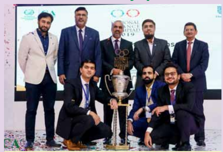
Team EY Ford Rhodes recieving recognition for winning title of National Finance Champions 2019.

The Institute of Chartered Accountants of Pakistan (ICAP) Professional Accountants in Business (PAIB) Committee, in collaboration with Unilever Pakistan, organised the National Finance Olympiad (NFO) 2019 during December 12-19, 2019.