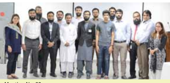
Meeting No. 82.